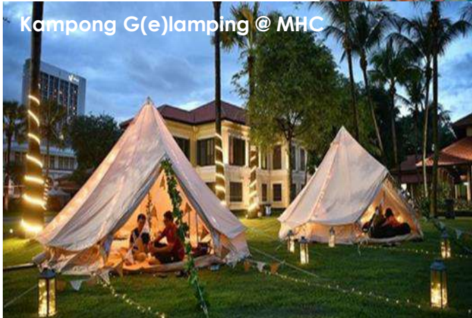
Kampong G(e)lamping @ MHC