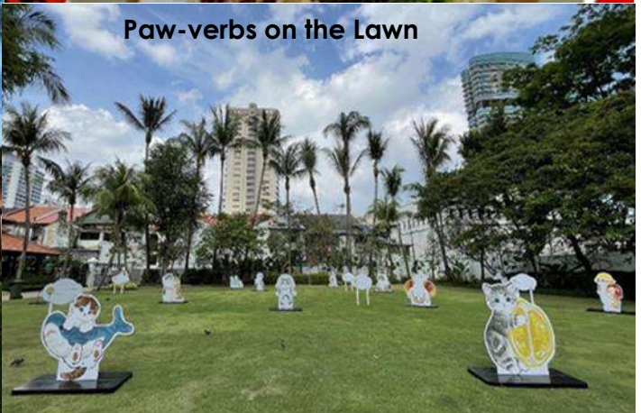
Paw-verbs on the Lawn