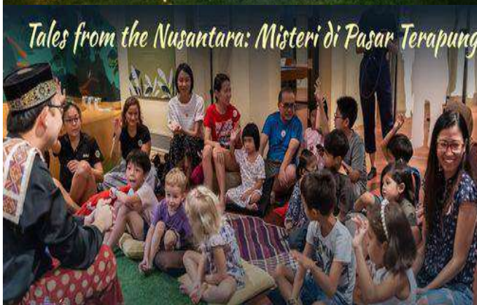
Tales from the Nusantara: Misteri di Pasar Terapung