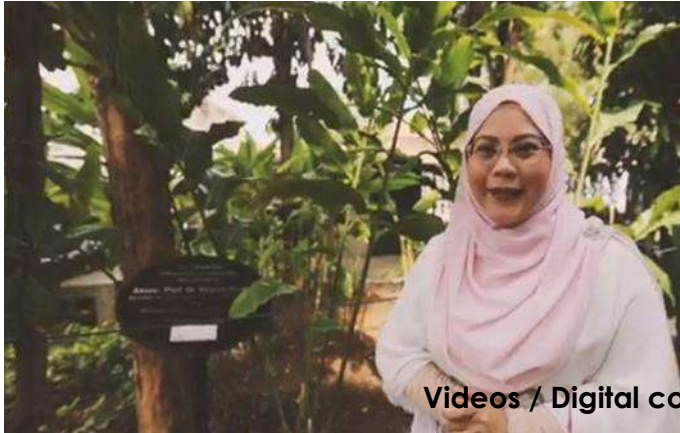
Videos / Digital content for online engagement