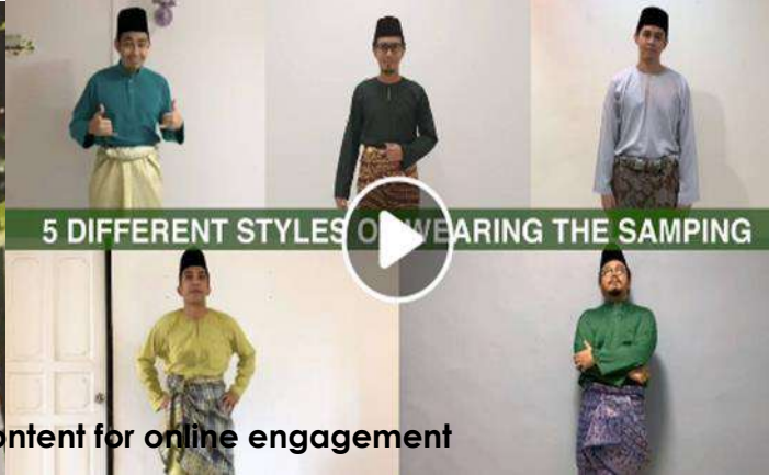
5 DIFFERENT STYLES OF WEARING THE SAMPUNG