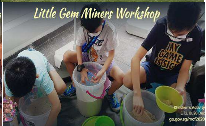
Little Gem Miners Workshop

Children's Activity 5, 12, 19, 26 Dec go.gov.sg/mcf2020